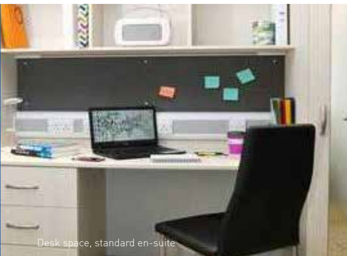
Desk space, standard en-suite