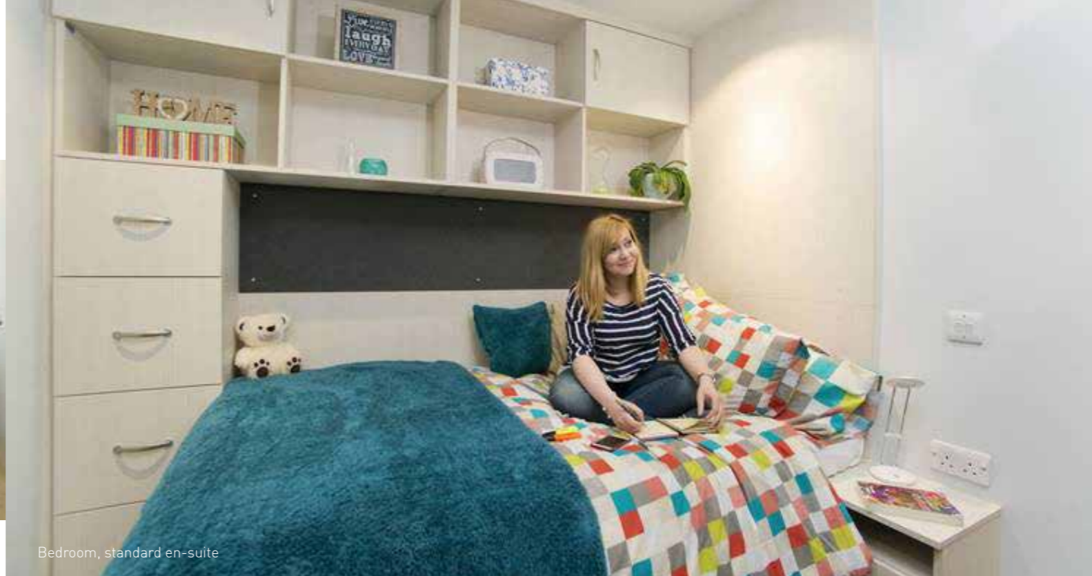
Bedroom, standard en-suite