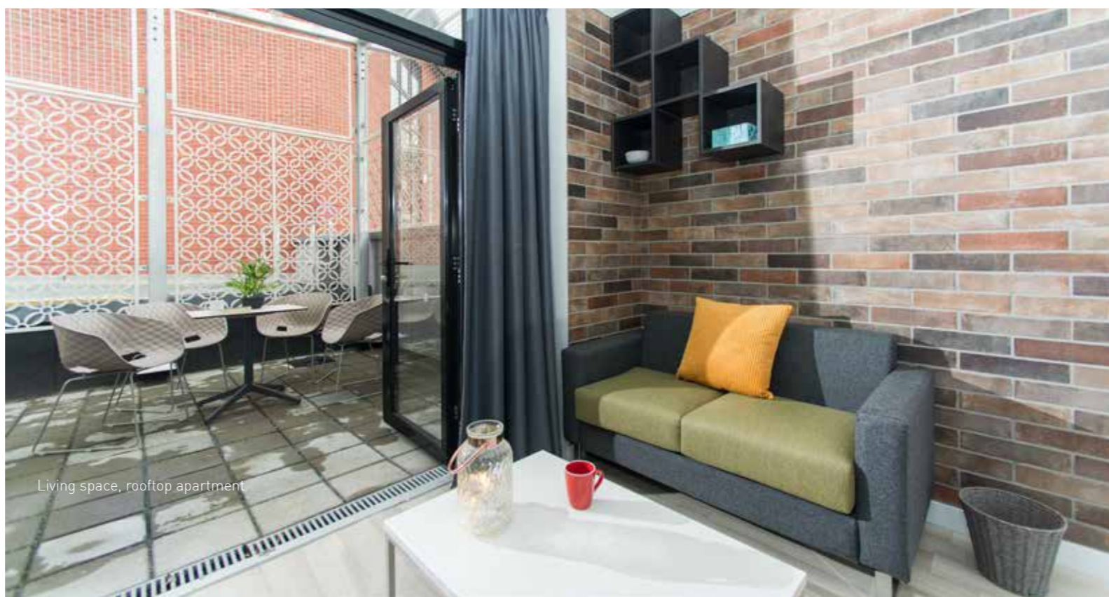
Living space, rooftop apartment