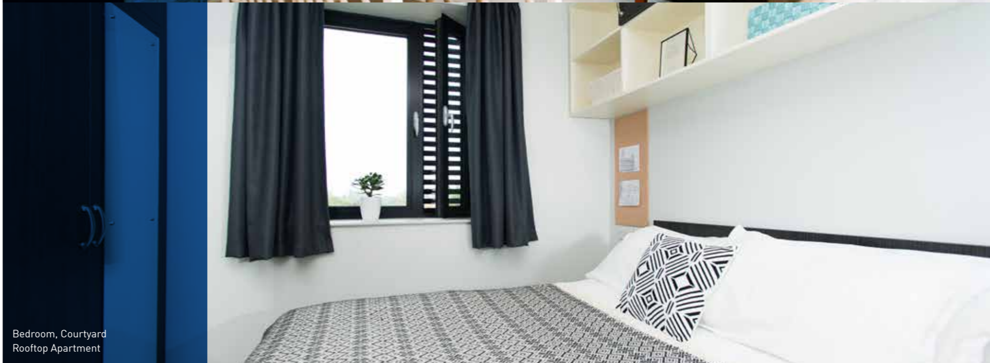
Bedroom, Courtyard Rooftop Apartment