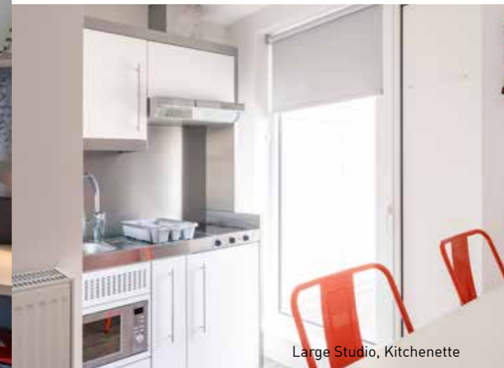
Large Studio, Kitchenette