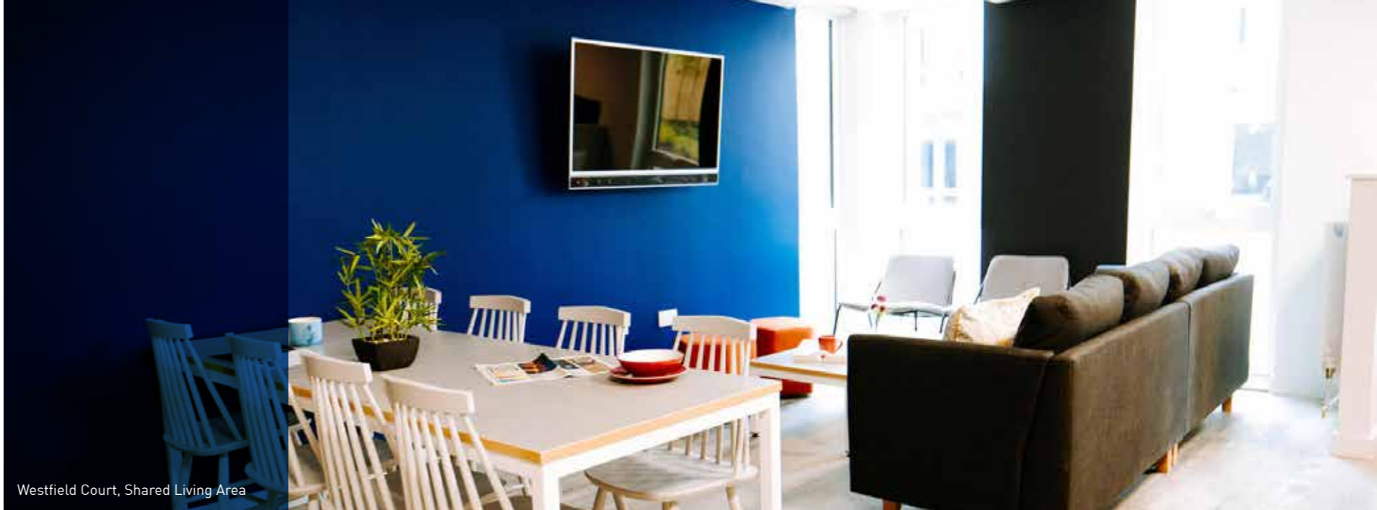
Westfield Court, Shared Living Area