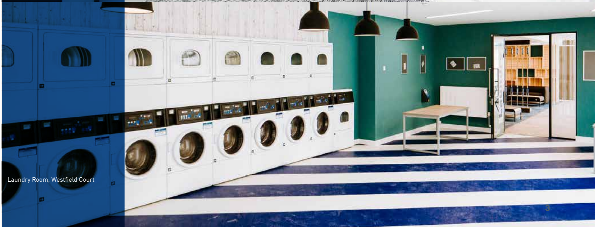
Laundry Room, Westfield Court