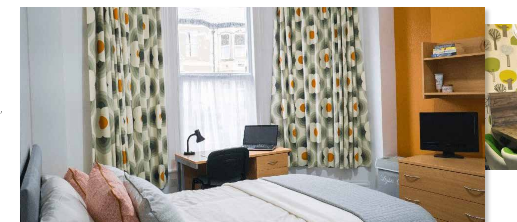
The UQ accommodation is owned and managed by Kexgill Ltd