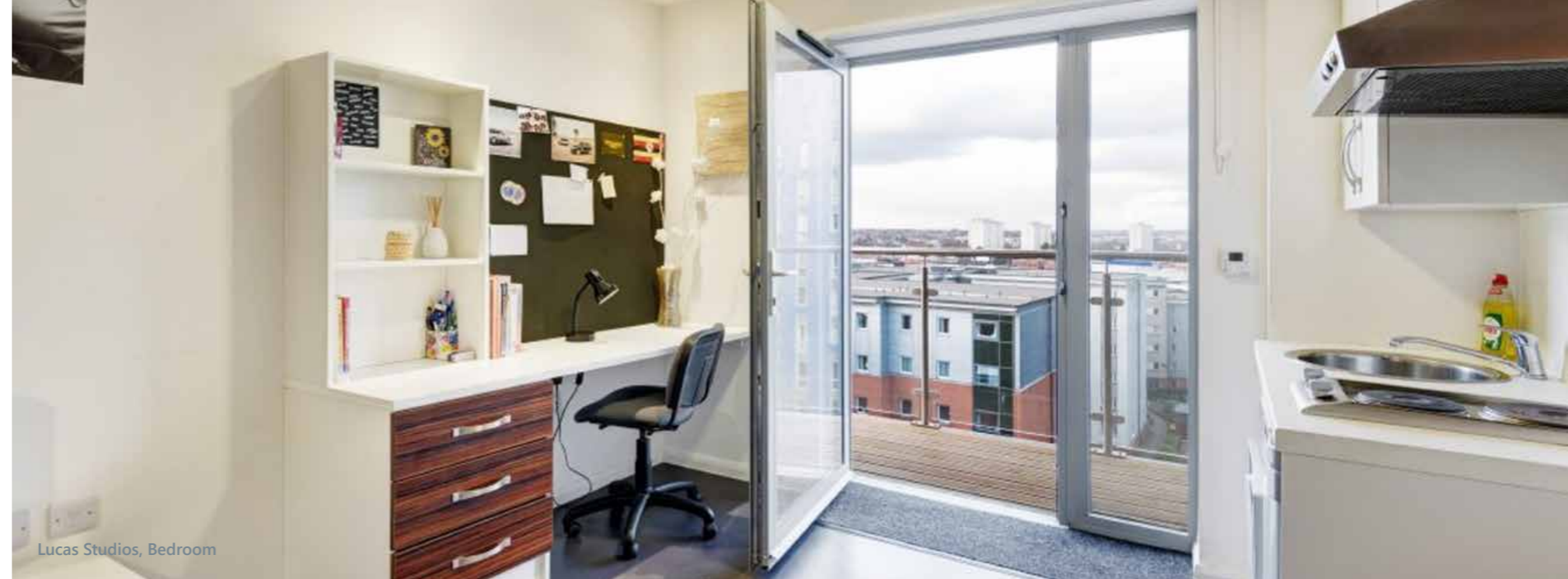
Lucas Studios, Bedroom