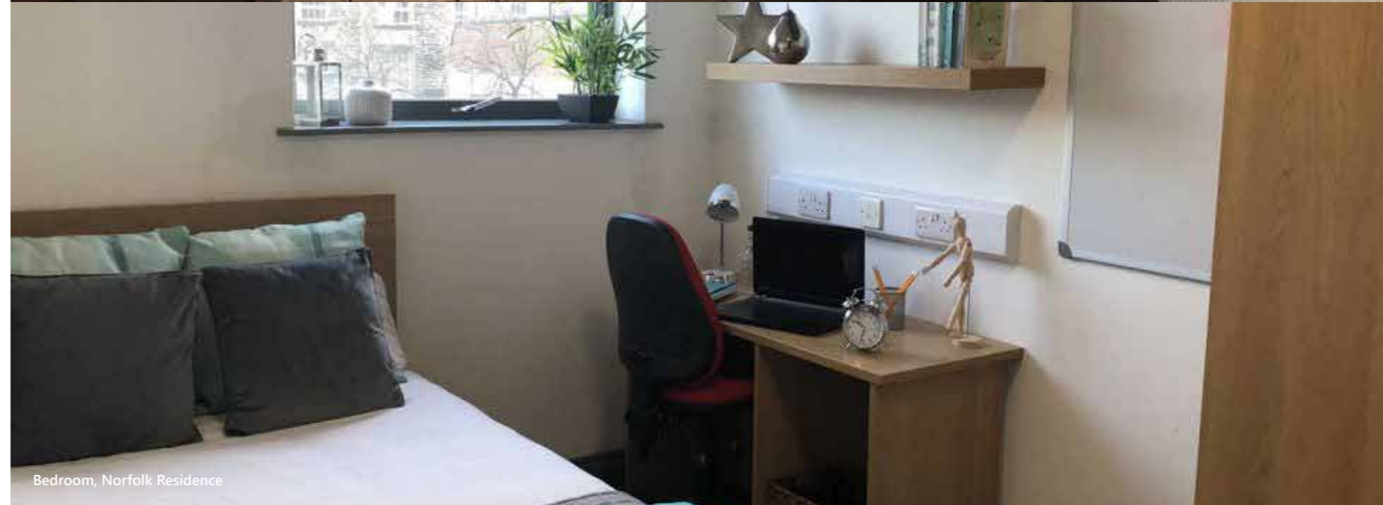
Bedroom, Norfolk Residence