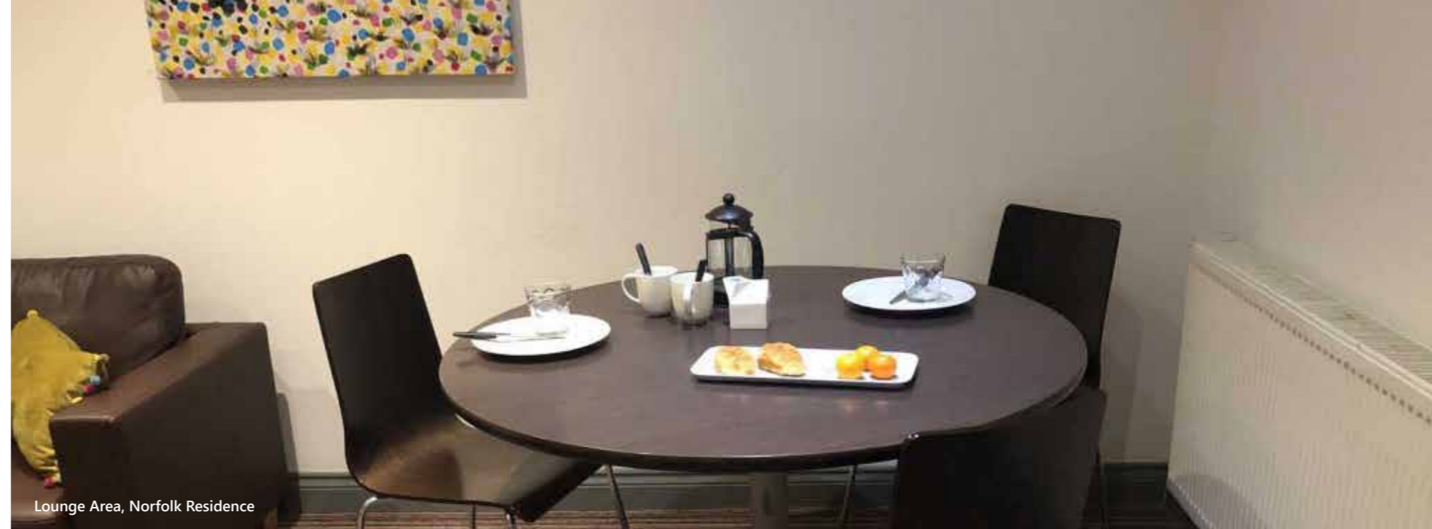
Lounge Area, Norfolk Residence