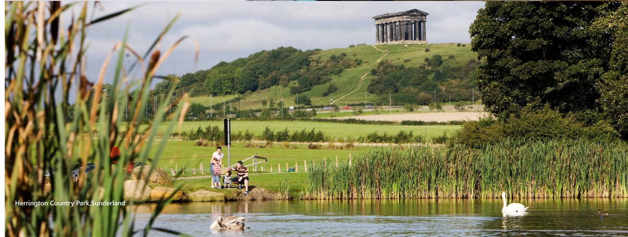
Herrington Country Park, Sunderland