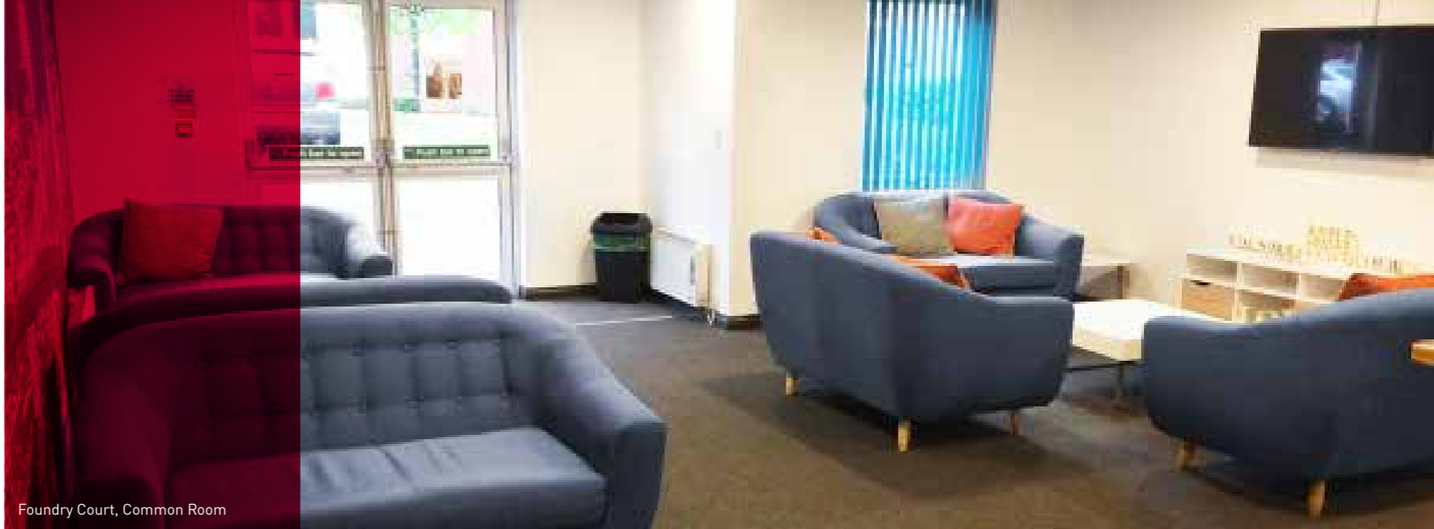
Foundry Court, Common Room