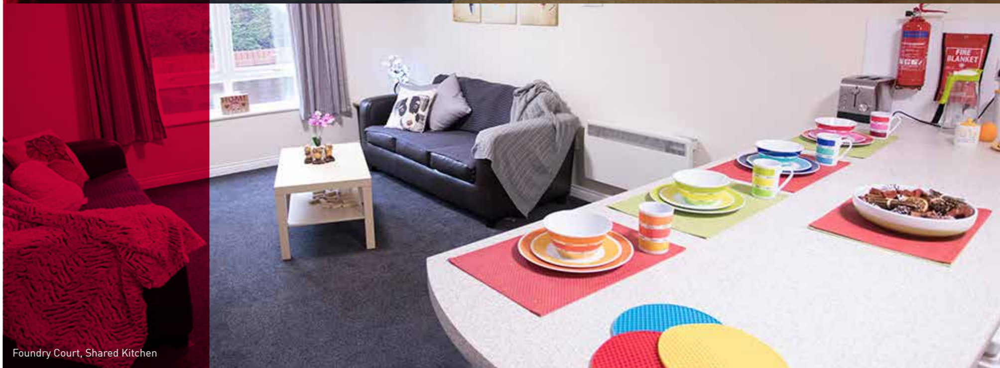
Foundry Court, Shared Kitchen