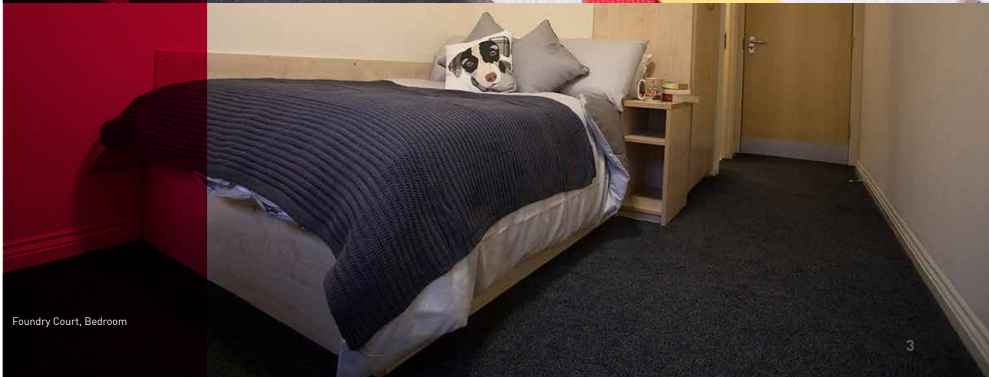
Foundry Court, Bedroom