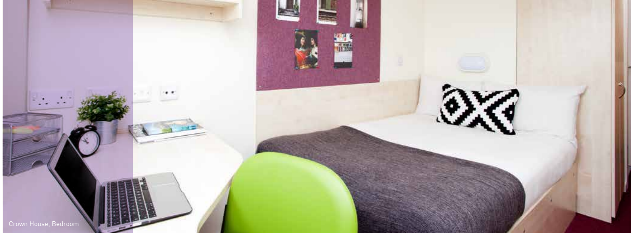
Crown House, Bedroom