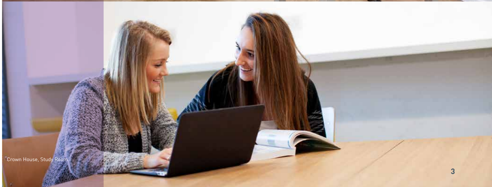
Crown House, Study Room