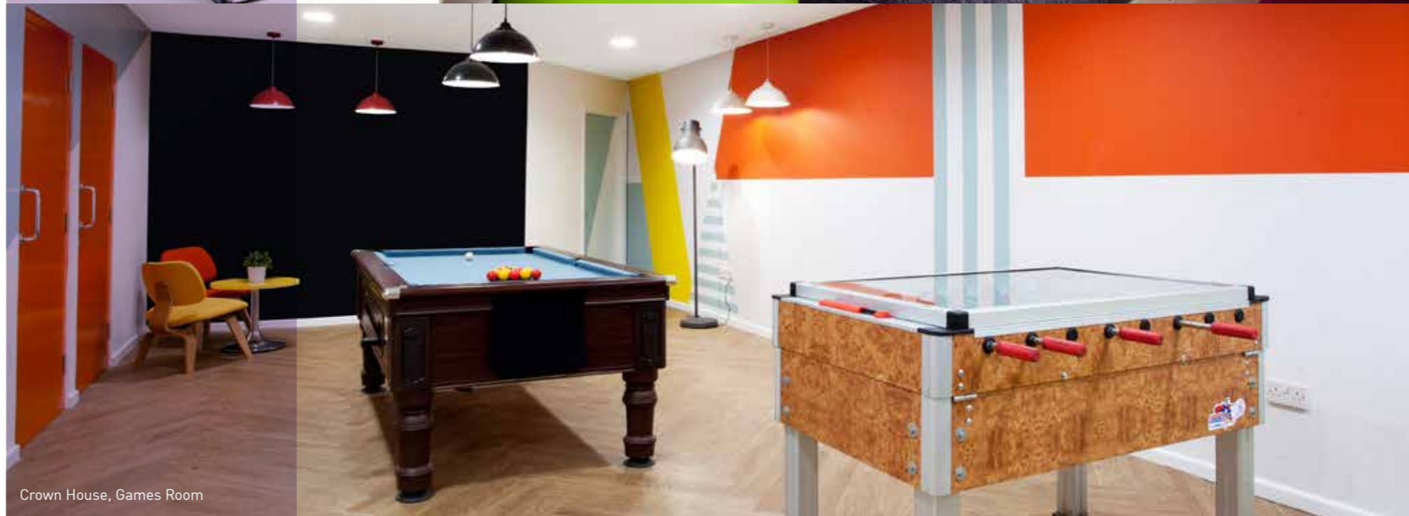
Crown House, Games Room